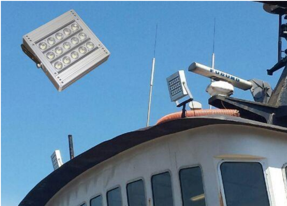
Project with BBM MARINE PRO IP68 600W Ledlighting